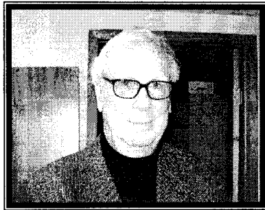
Greeting from the President

Office Hours: Monday to Friday 9:00am - 12:30pm; 1:30pm - 4:00pm